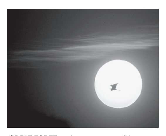
GREAT EGRET — As a great egret glides across a setting sun at Quivira National Wildlife Refuge, we are reminded of the special places and wildlife helped by the Chickadee Checkoff. Please remember your contribution on your Kansas Form K-40.