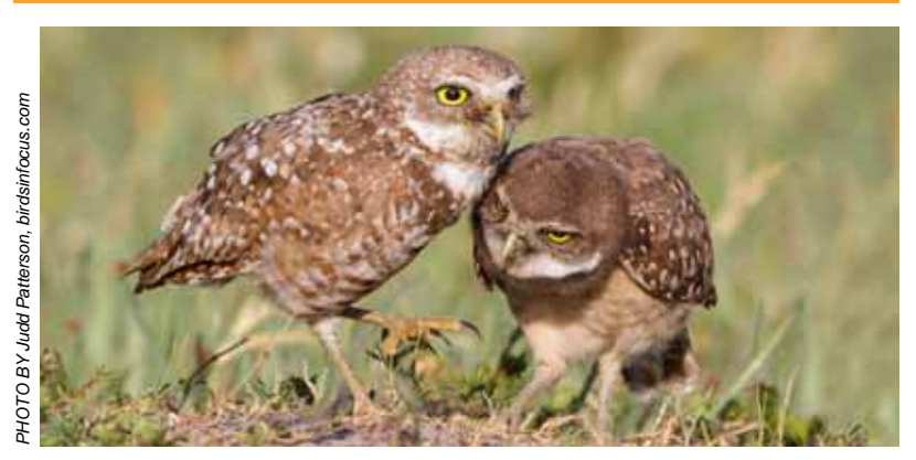
The BURROWING OWL is the only North American raptor to nest in the ground and often occupy burrows or cavities abandoned by other wildlife species. These owls are often easily seen during the day standing or roosting near their burrow. When threatened, chicks of this species emit a noise that sounds like a rattlesnake to deter potential predators. While not on the current list for sensitive species, they are definitely in danger of losing habitat and need your support. Contribute to chickadee checkoff on your Form K-40 to help conserve this and other fascinating Kansas critters.

If you have any questions about use tax or about your responsibilities for reporting and paying this tax as an individual Kansas consumer, please contact our Taxpayer Assistance Center (see page 26).